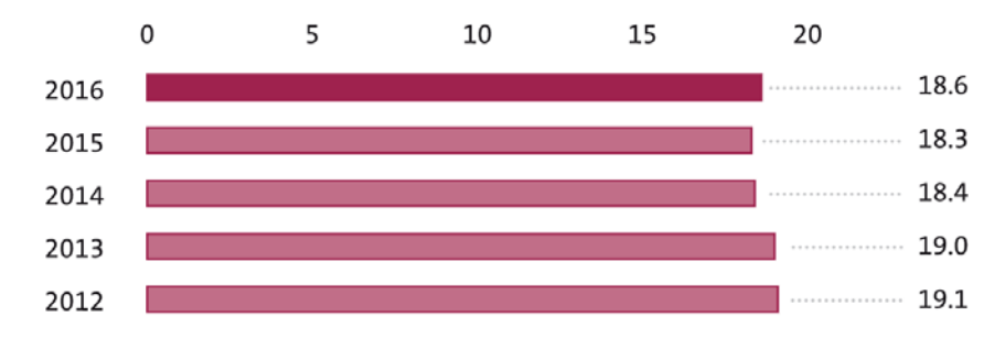
Figure 3. Average Period of Employment (Volkswagen Goals and Strategies, 2016)

The turnover costs can be high even for a well-established company and having a higher retention can save thousands in costs for replacement of just one employee. Laddha