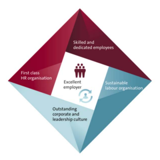
Figure 2. Strategic Objectives (Volkswagen Goals and Strategies, 2016)

organization are barrier-free to access. Moreover, the company has also introduced flexible working hours, so that employee can have a better work-life balance.