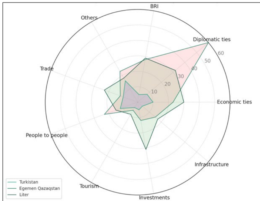
Figure 1: Media Coverage Frequency Pertaining to China

Note: The radar chart represents the frequencies of different topics about China in Turkistan, Egemen Qazaqstan, and Liter. Each axis of the chart corresponds to one of the topic categories, and the distance from the center on each axis indicates the frequency of that topic in the respective media.