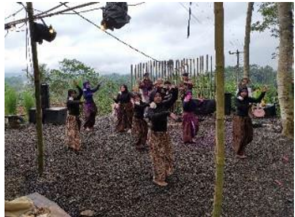
Figure 1. Dance class in Sekolah Alam Binangkit

Sekolah Alam Binangkit is located in Cigalontang Village RT 11 RW 04 Jayapura Village, Cigalontang District, near the Al-Hikmah Mosque and Madrasah. The venue is a large open field accommodating 100-200 people. The location is easily accessible because it is next to the main road. However, its location makes it difficult for prospective students to get to the school (Figure 1).