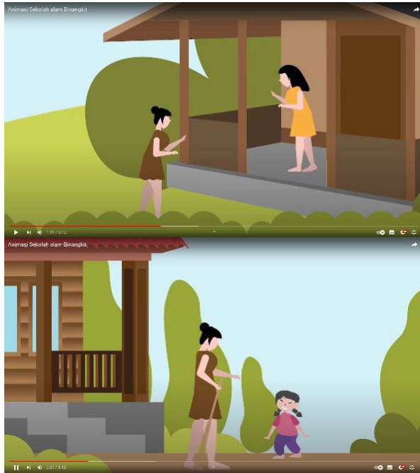
Figure 7. Yanti with her mom and her mother gaining information from another mother

x 720 pixels. Screenshots of Sekolah Alam Binangkit's promotional animation video can be seen in Figure 7.