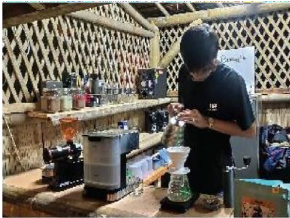
Figure 2. Implementation of Coffee class

Sekolah Alam Binangkit is certainly different in the learning process because it is adapted to focus on learning Sundanese customs or culture. It means that all types of activities in nature schools tend to focus on Sundanese cultures, such as angklung, pencak silat, and jaipong. The student learning process is made effective because there is a more direct practice to facilitate student understanding. This learning is the core of the educational process because the output quality also depends on the process (Figure 2).