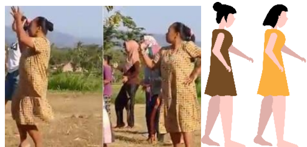
Figure 6. Parents who accompany their children in Sabangkit and the character's interpretation of the mother

Children who have become students wear kebaya, cloth, and a shawl. For the visual interpretation of the character, she is depicted using a shawl (see Figure 5).