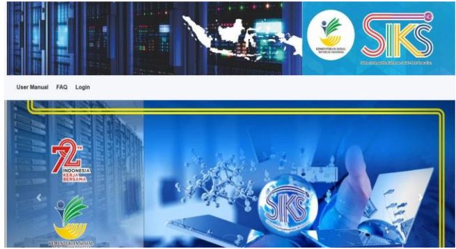
Figure 1: SIKS-GS Homepage

The SIKS-NG application is a management application for the process of improving and proposing new data in the Integrated Database (BDT). Regency/City Operators carry out the process of updating data through offline-based applications. The purpose of this application is to generate summary data, such as recapitulation. The GIS Web display also displays data on the results of improvements/proposals made by operators in offline-based applications. It processes them to produce a local Social Service Authorization Letter directly from the Application System. In addition, the results of updating each region will also be able to instantly download the file after the data is finalized for each period. It is also possible to transfer households between regions within one Regency/City. In figure 1, we can see the SIKS-GS Homepage.