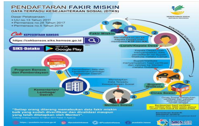
Figure 4: The display of Procedure for Data Collection through SIKS-GS.

Periodic updating of data by district/city Social Services through SIKS-NG distributes the social security fund to the right target, in the right amount, and at the right time.